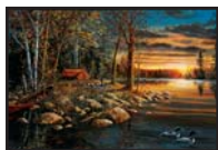
Wake up Call